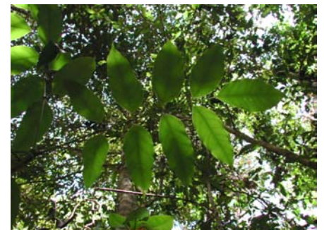
Polyscias australiana , site 2

– Light requirements for maturity range from direct illumination to understorey shade.