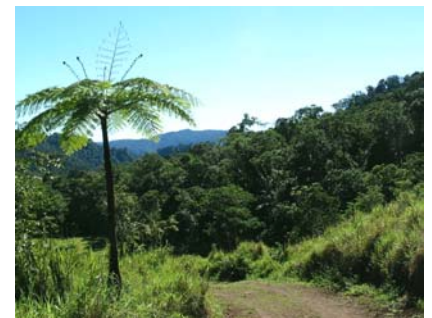
Brooks Valley, site 1